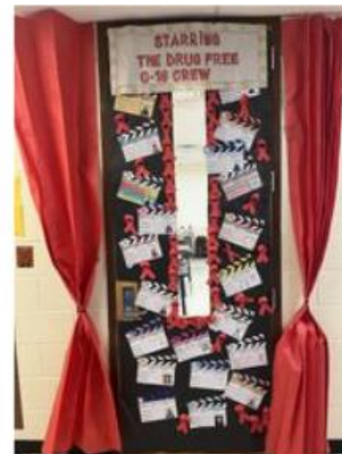
Images (clockwise) Winning doors from top left: A-03 Cunningham, C-16 Leite/Poehls, D-01 Dewey/Sides, E-03 Mangla/Grundel